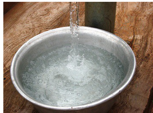
To clean drinking water