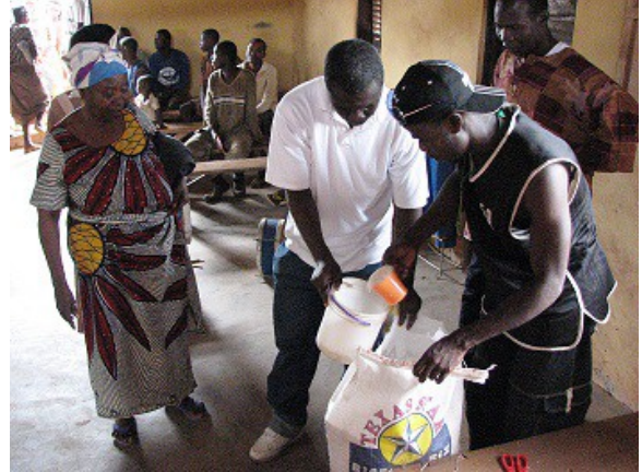
Enough for everybody

Especially for the little ones, we bring clothes and warm blankets