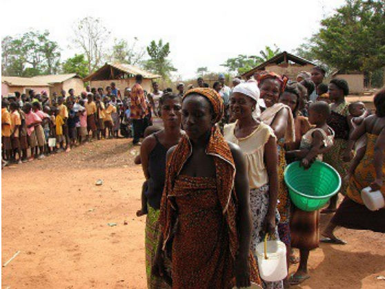
In line for rice

We always visit villages to see how big the need is for their own clinic, a bore hole etc. We usually take food and clothes with us to hand out to the people.