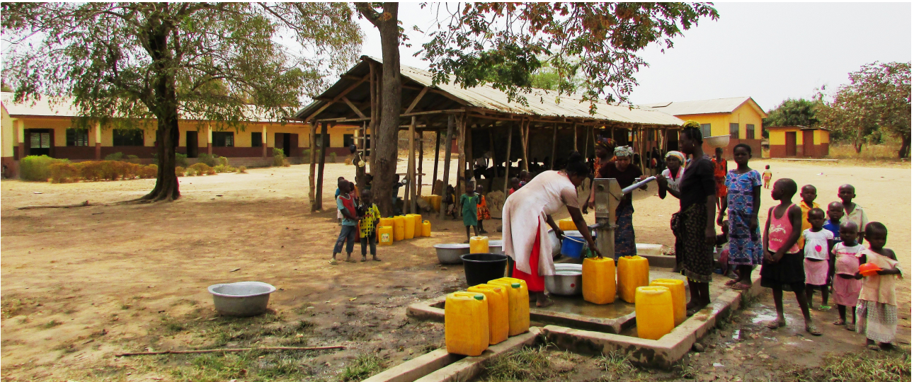
Aduonya waterpump with old school, new school and clinic in the background