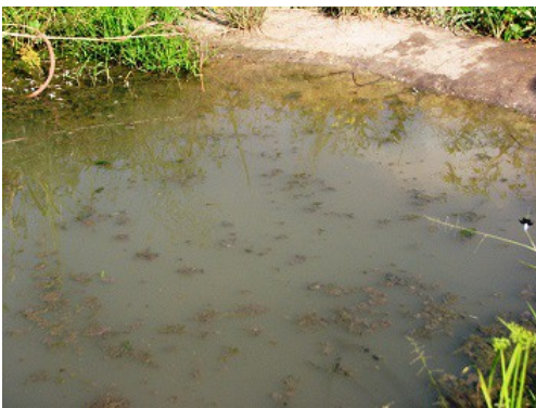
From infected, dirty water