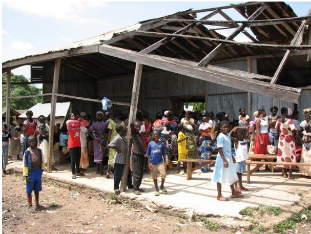
The old clinic in Kwabenakuma

The clinic also got showers and toilets with running, hot water.