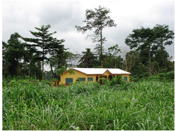
The new clinic in Kwabenakuma